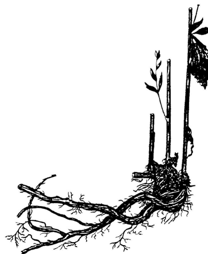
Figure 2. Woody crown and roots.