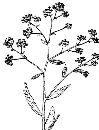
Figure 1. Flowering stalk of perennial pepperweed.

Perennial pepperweed is a long-lived herbaceous perennial that thrives in seasonally wet areas or areas with a high water table. Perennial pepperweed is typically found invading fine-texture, saline/sodic soils, although populations can establish and persist on coarse-textured, alluvial soils. Plants reproduce from perennial roots or seed. In early spring, new shoots emerge from root buds forming low-growing rosettes (basal leaves with no obvious stem). Plants remain in the rosette stage for several weeks before developing a flowering stem. Flowering typically begins in late spring with mature seed being produced by mid-summer. After seed production, flowering shoots die back, although rosettes can emerge again in fall and persist through winter in frost-free areas. Dead stems are slow to decay and accumulate over time, forming dense thickets that prevent growth of desirable species. Perennial pepperweed is a prolific seed producer. Laboratory tests suggest seeds germinate readily with fluctuating temperatures and adequate moisture; however, seeds do not appear to remain viable in the soil for extended periods.