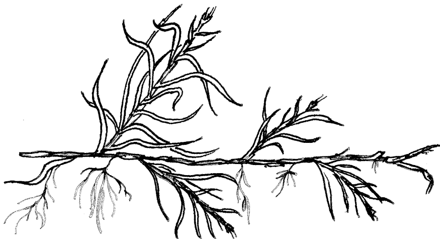
Figure 1. Kikuyugrass stolon showing rooting at nodes.

Kikuyugrass is a perennial grass that grows best under cool to warm temperatures (60° to 90°F) and moist conditions; however, it also survives well at high temperatures (100°F). Like bermudagrass, kikuyugrass has a special photosynthetic pathway that allows it to assimilate carbohydrates at a high rate and to grow rapidly during periods of high light intensity and warm temperatures. But, unlike bermudagrass, kikuyugrass is able to maintain its steady growth rate at lower temperatures. In coastal and some inland valley areas, kikuyugrass may not go dormant in winter. In other inland areas of California, it often turns brown in late November and remains dormant until February or March, depending on temperature. After kikuyugrass resumes growth in late spring, a rapid growth rate is reached by early summer and maintained through early fall. When