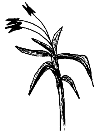
Figure 4. Kikuyugrass anthers protruding from stem.

When they are applied in March, preemergent herbicides have been successful in limiting germination of kikuyugrass seeds in spring and early summer. Pendimethalin, bensulide,