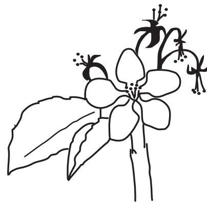
Figure 1. Fire blight infection. Blossoms infected with fire blight shrivel and turn black.

Fire blight bacteria overwinter in cankers, which may be inconspicuous, on twigs, branches, or trunks of host trees. In spring when the weather is sufficiently warm and moist and trees resume growth, bacteria multiply in diseased tissues and ooze from branch or twig surfaces in a light tan liquid (Fig. 2). The bacteria can be transmitted to nearby blossoms or succulent growing shoots by splashing rain or insects, especially honey bees. Injuries caused by wind, hail, or insect feeding to succulent tissues are easily invaded by fire blight bacteria. Ideal conditions for