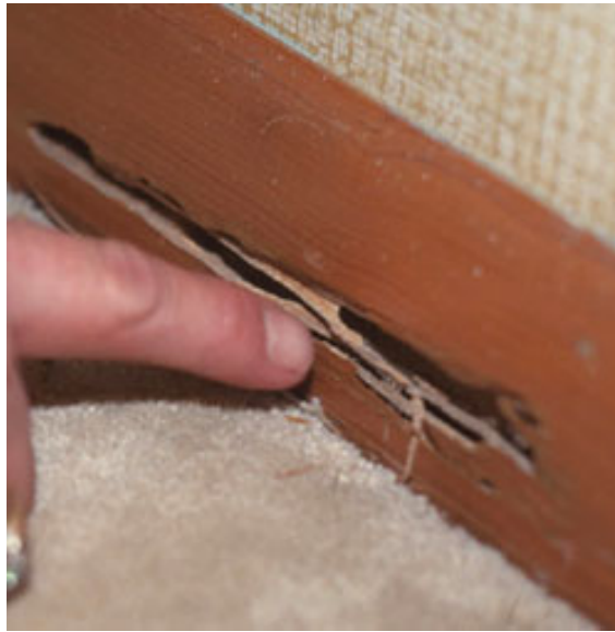
Termite damage to baseboard. Hidden infestation was discovered when vacuum cleaner attachment penetrated surface of baseboard.

Oftentimes there will be no visible indication that the home is infested. Termites are cryptic creatures and infestations can go undetected for years, hidden behind walls, floor coverings, insulation, and other obstructions. Termite feeding and damage can even progress undetected in wood that is exposed because the outer surface is usually left intact.