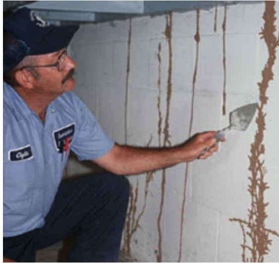
Mud shelter tubes on wall (another indication of termite activity).

Other signs of infestation are earthen (mud) tubes extending over foundation walls, support piers, sill plates, floor joists, etc. The mud tubes are typically about the diameter of a pencil, but sometimes can be thicker.