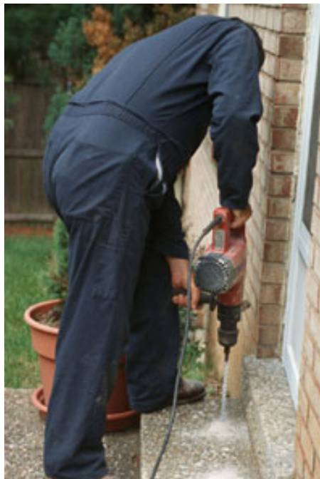
Ridding a home of termites requires specialized skills and equipment. Treatment is usually done by professionals.

A: Ridding a home of termites requires special skills. A knowledge of building construction is needed to identify the critical areas where termites are likely to enter. Many of these potential points of entry are hidden and difficult to access. Termite control also utilizes specialized equipment such as masonry drills, pumps, large-capacity tanks, and soil treatment rods. A typical treatment may involve hundreds of gallons of a liquid pesticide, known as a