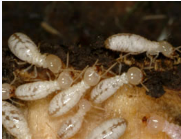
Termite workers, the life stage that causes damage.

Termites construct these tubes for shelter as they travel between their underground colonies and the structure. To help determine if an infestation is active, the tubes may be broken open and checked for the presence of small, creamy-white worker termites.